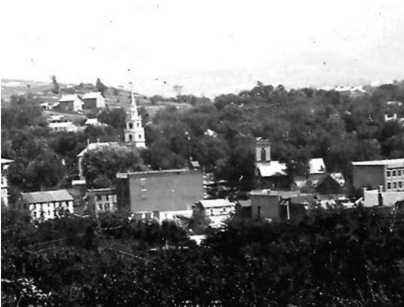
View of Middlebury Village, c. 1900. Chipman Hill to left, Green Mountains in the distance.