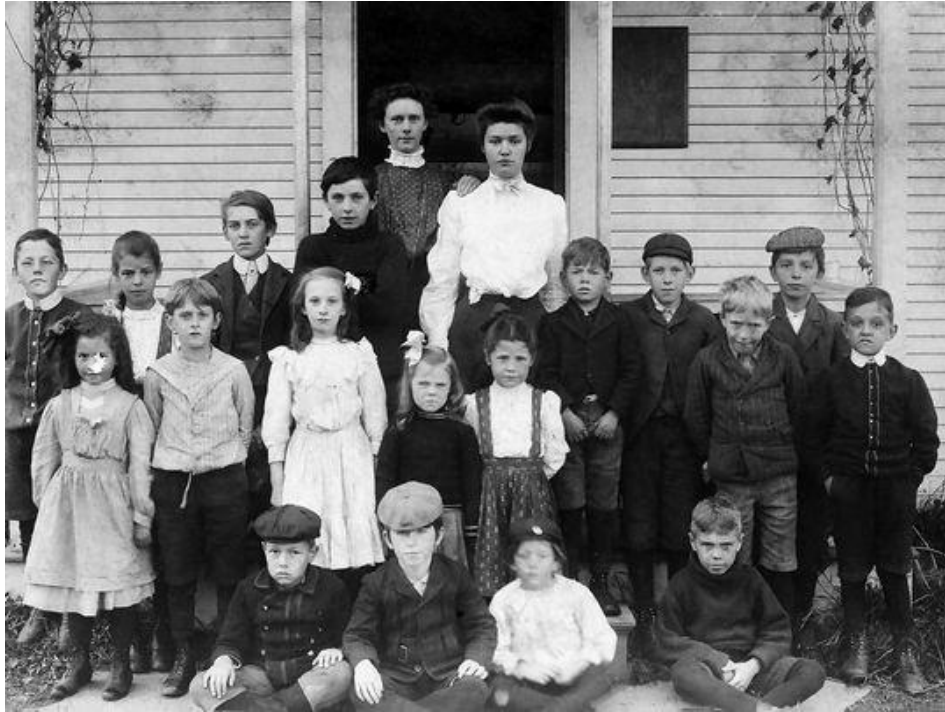
Children in front of rural schoolhouse in Addison County, c. 1895.

Remarkably, photography arrived in Middlebury, shortly after its European unveiling. Already in June 1843, a local newspaper , The People's Press, began advertising daguerreian artists (aka photographers), who offered to take "daguerreotype miniatures" The ad asserted that the "productions of this [photographic] process are the works of nature, and not of art — the light of heaven alone is the pencil used."