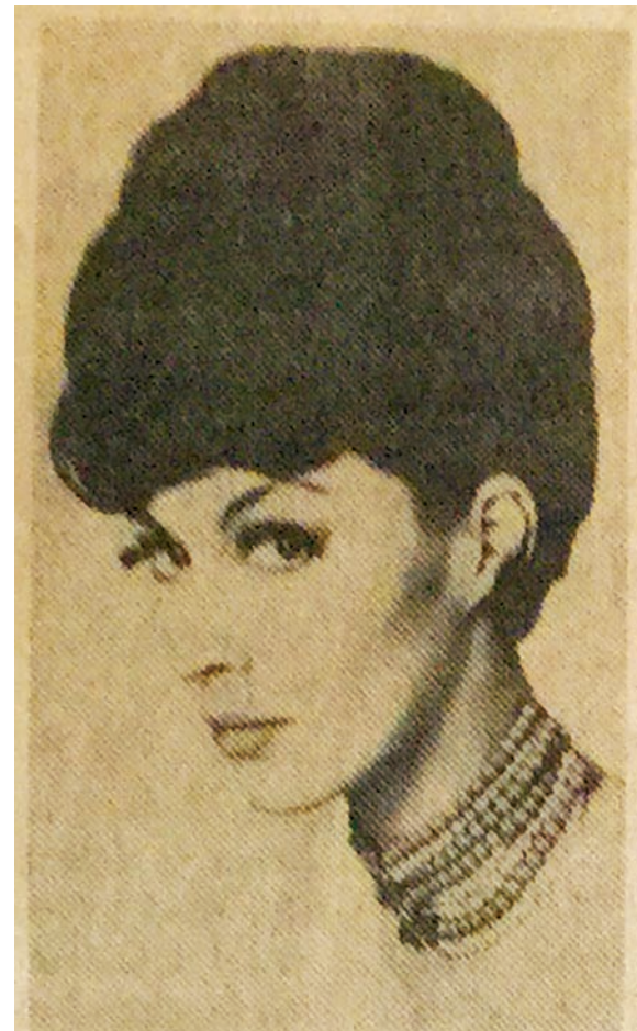
Fashion Model Gabrielle as she appeared in a newspaper article

Karsch's talk on the 14th is free with museum admission. The Sheldon is located at 1 Park Street in downtown Middlebury across from the Ilsley Library. Museum hours: Tues.-Sat. 10 a.m.-5 p.m.; Sundays 12-4 p.m.; Research Center hours: Thurs. and Fri. 1-5 p.m. Admission to the museum is $5 for adults; $3 youth (6-18); $4.50 seniors; $12 family; $5 Research Center. Visit henrysheldonmuseum.org for information about the Hidden Treasures series schedule.