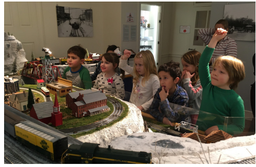
The train exhibit attracts lots of excited kids.