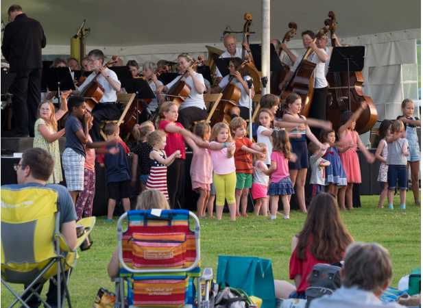
Kids singing "Baby Shark" during Pops Concert