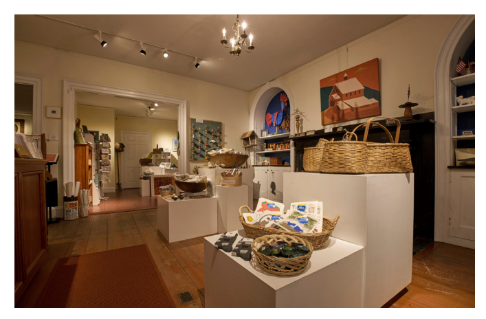
Interior of our store

Cover of The Dog Team Tavern book available in the Museum Store and online