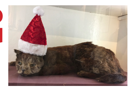
The infamous stuffed cat shared his holiay spirit!